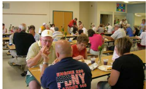
Hundreds enjoy the Barbecue!

An old fashioned potluck and barn dance will take place two weeks after the Ice Cream Social on Saturday, September 23. Attendees are asked to bring a covered dish and or dessert plus your own table service. Beverage, napkins, tables and chairs will be provided. The potluck will begin at 6:00 p.m. and finish by 7:30 p.m. The entertainment for the evening will be provided by the Bluegrass band that meets and plays at Sanders Auto Lab and has been featured on many local newscasts. At press time for the newsletter, an attempt was being made to arrange for a square