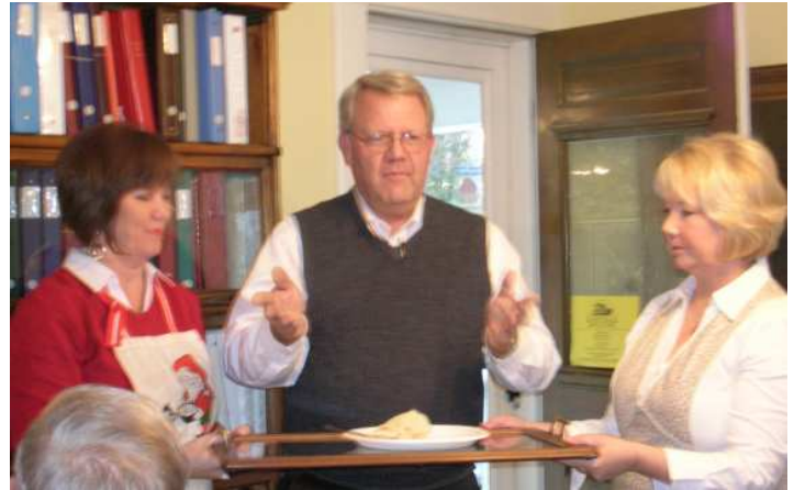
A fish and lefse explained and constructed.