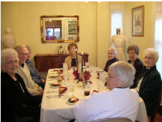
Fish, potatoes and lefse—a Norsky tradition.