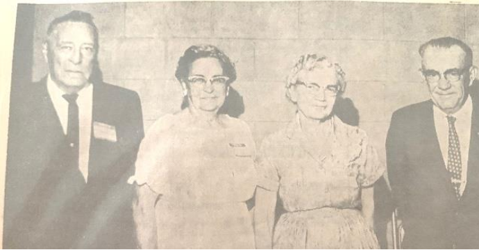
50-Year Class at Ankeny Alumni Reunion